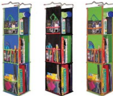
LockerWorks® The hanging locker organizer that expands usable space with three sturdy shelves and side pockets