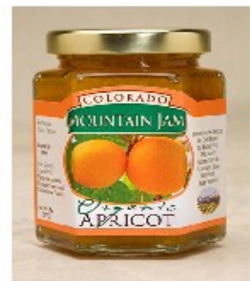
Colorado Mountain Jam Award-winning organic jam – can be customized with your logo