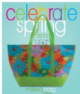
Mixed Bag Designs Eco chic reusable bags – new prints and styles for spring